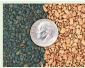
Field & Fairway™—designed for native soils for use on: fairways, tees, approaches, high traffic areas, poor draining or oxygen-deprived soils.