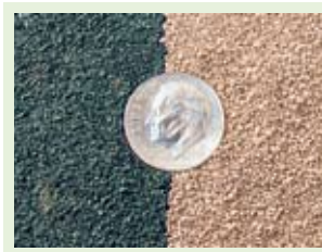
Profile™ Greens Grade™—meets USGA particle size recommendations. Ideal for sand-based root zones.

Available in 50-lb bags 2000-lb bulk sacks Bulk dump trucks (23-25 tons) (Available in both Natural and Emerald)